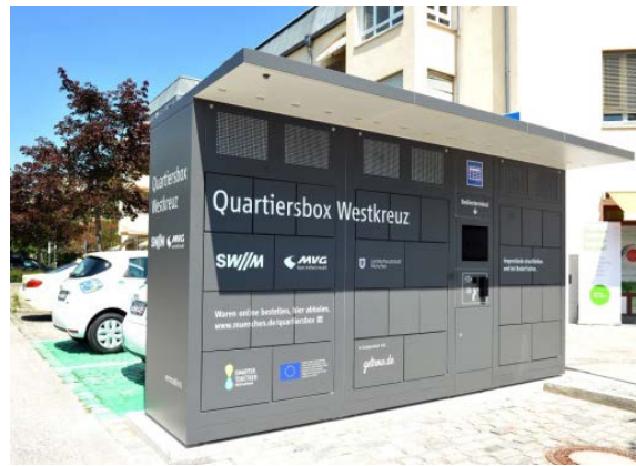
Figure 6: Shared district box front side