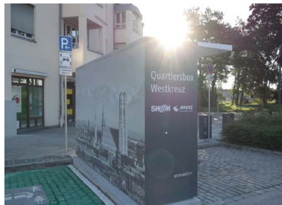
Figure 7: Shared district box side and rear side