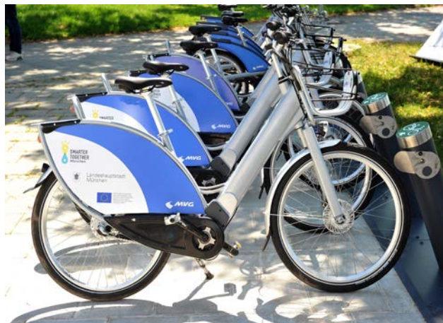
Figure 4: Bike-sharing system