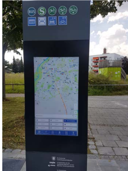
Figure 12: Information column with the Smart City Webapp