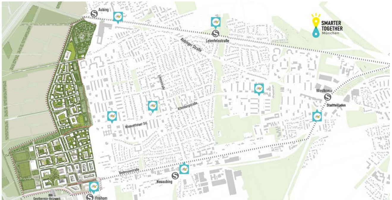
Figure 1 City map with eight e-mobility stations in the district