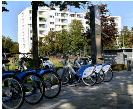
Figure 3: One e-mobility station in the project area

Like many projects, MVG e-bike also faced several challenges, especially regarding the on time delivery of e-bike stations as well as the e-bikes.