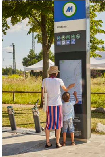
Figure 10: Information column with interactive touchscreen