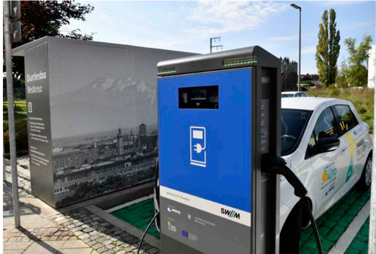
Figure 9: Charging station