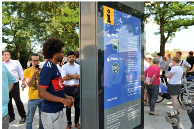
Figure 11: Information column with display case