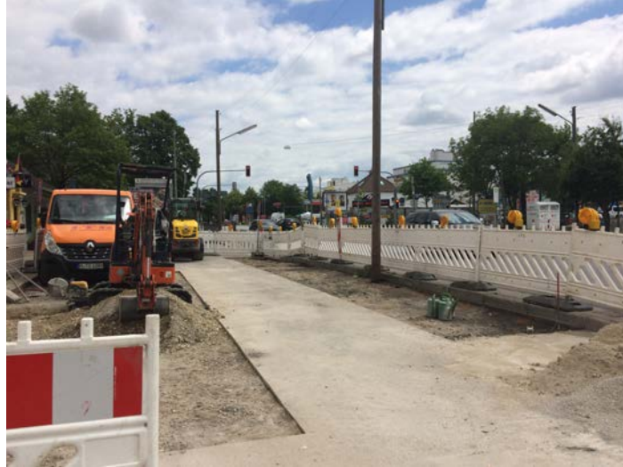
Figure 2: Construction site of an e-mobility station