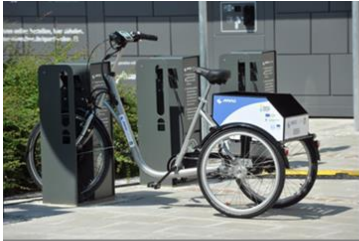
Figure 5: E-trike with cargo bike functionalities

The app, the customer portal and background system were successfully integrated and MVG e-trikes gone live in January 2019.